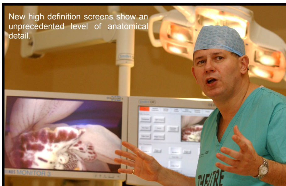
New high definition screens show an unprecedented level of anatomical detail.